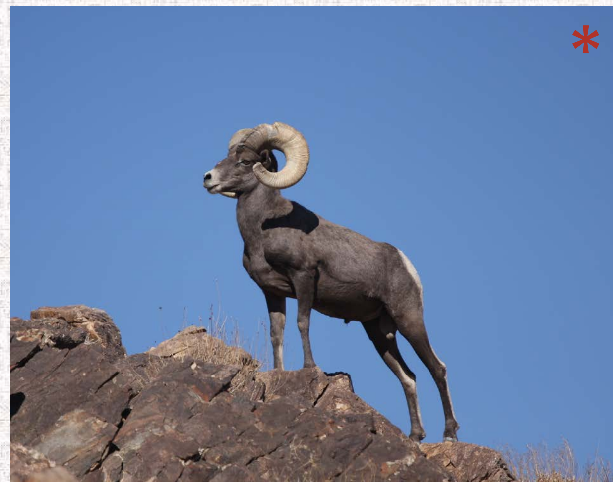
Above left to right, top to bottom: Western Kingbird, Black-Tailed Jack Rabbit, Townsend Big-Eared Bat, Desert Tortoise, Razorback Sucker, Southwestern Willow Flycatcher, Common Chuckwalla, Nelson's Bighorn Sheep.