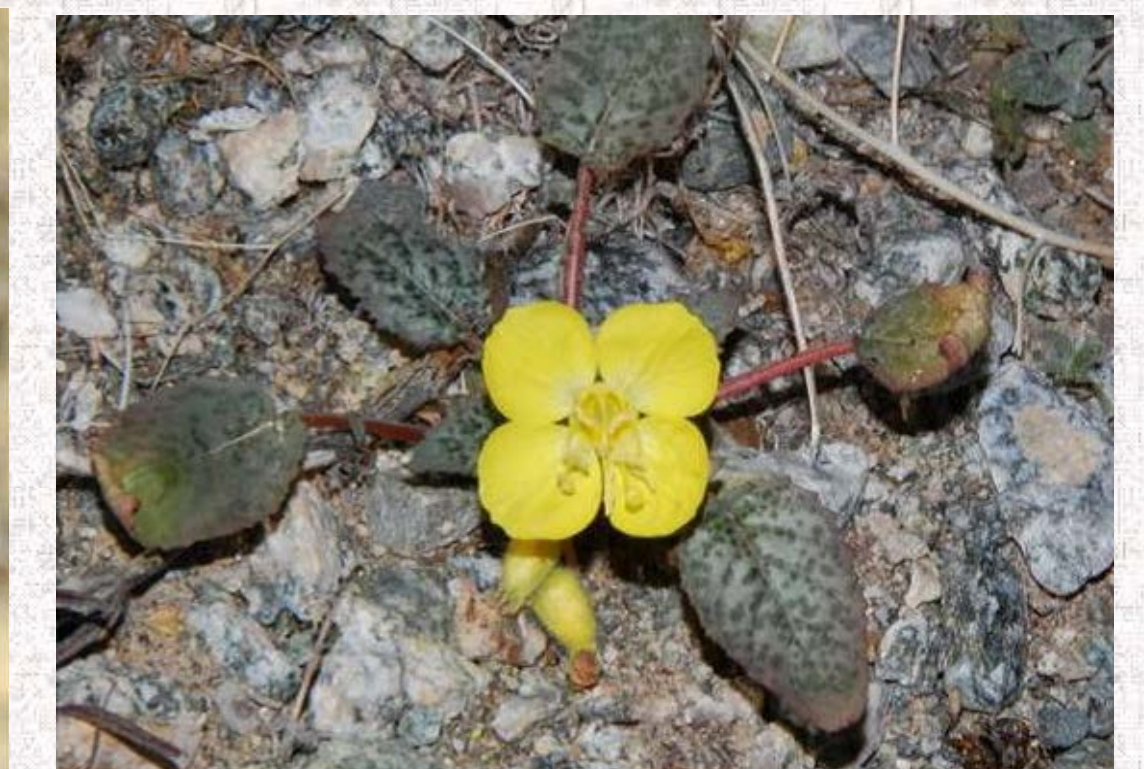
Above left to right, top to bottom: Honey Mesquite, Screwbean Mesquite, Chia, Golden Suncup. All four are species of cultural significance.