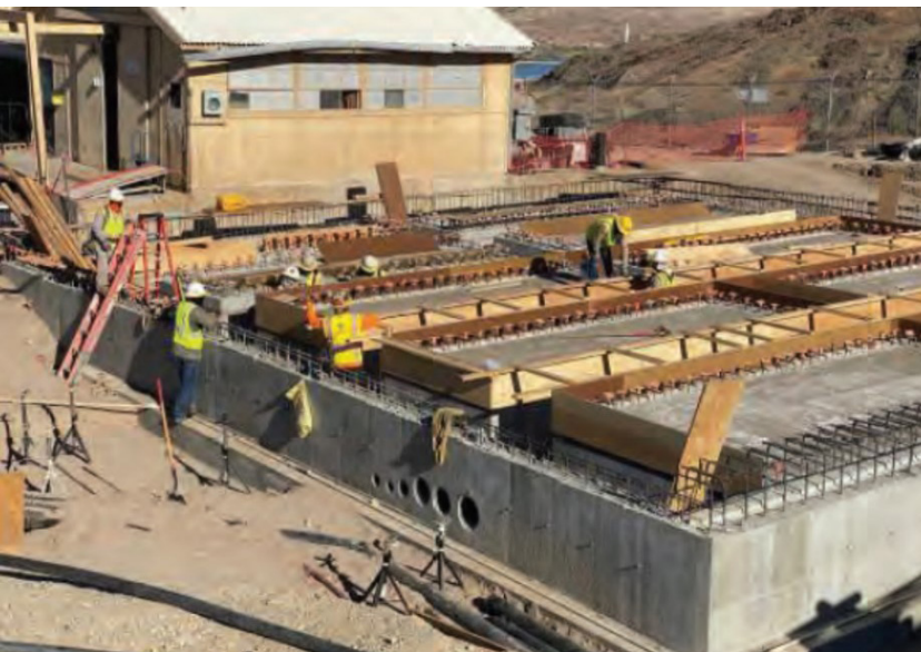
INSTALLATION OF A TANK FARM INSIDE THE COMPRESSOR STATION TO MANAGE WASTEWATER FROM THE GROUNDWATER REMEDY

In 1951, the Station began compressing natural gas for transportation through pipelines to PG&E's service area in central and northern California. As natural gas is compressed, its temperature increases and must be cooled. From 1951 to 1985, PG&E added chromium to the water used in the cooling towers and other equipment to prevent equipment corrosion. From 1951 to 1964, cooling tower wastewater containing Cr(VI) was discharged into a natural wash adjacent to the Station. In addition, historical operations at the Station have also resulted in contamination of soils located both outside and inside the fence line. Over time, the Cr(VI) seeped into the groundwater and created a groundwater plume that extends from below the Station towards the Colorado River. Based on results from periodic testing of the river water, the Cr(VI) contamination is not impacting the quality of the river water.