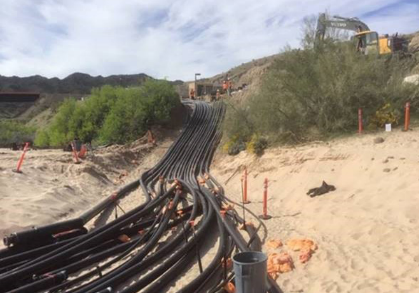
INSTALLATION OF PIPING AND CONDUITS IN THE FLOODPLAIN TO THE MW-20 BENCH